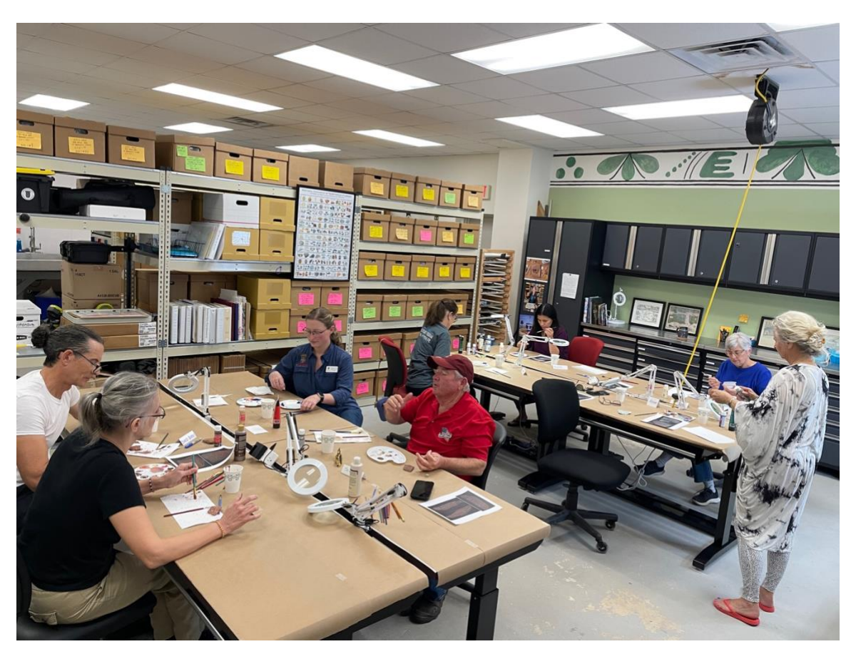
Participants learned about 3D modeling and printing, before painting their own model created from artifacts in the City of St. Augustine's collections.

The Northeast Regional Center partnered with the City of St. Augustine Archaeology Program to offer a special program on 3D digital heritage in celebration of Florida Archaeology Month. FPAN staff gave a brief talk and demonstration to 10 participants on 3D modeling in archaeology, including taking photos and printing models. Participants were then able to choose a model from a selection of artifacts modelled and printed from the City's collection to paint and take home. The program was a culmination of several years of partnership in digitizing materials from the City's collection to make them more accessible to the public in the form of 3D models.