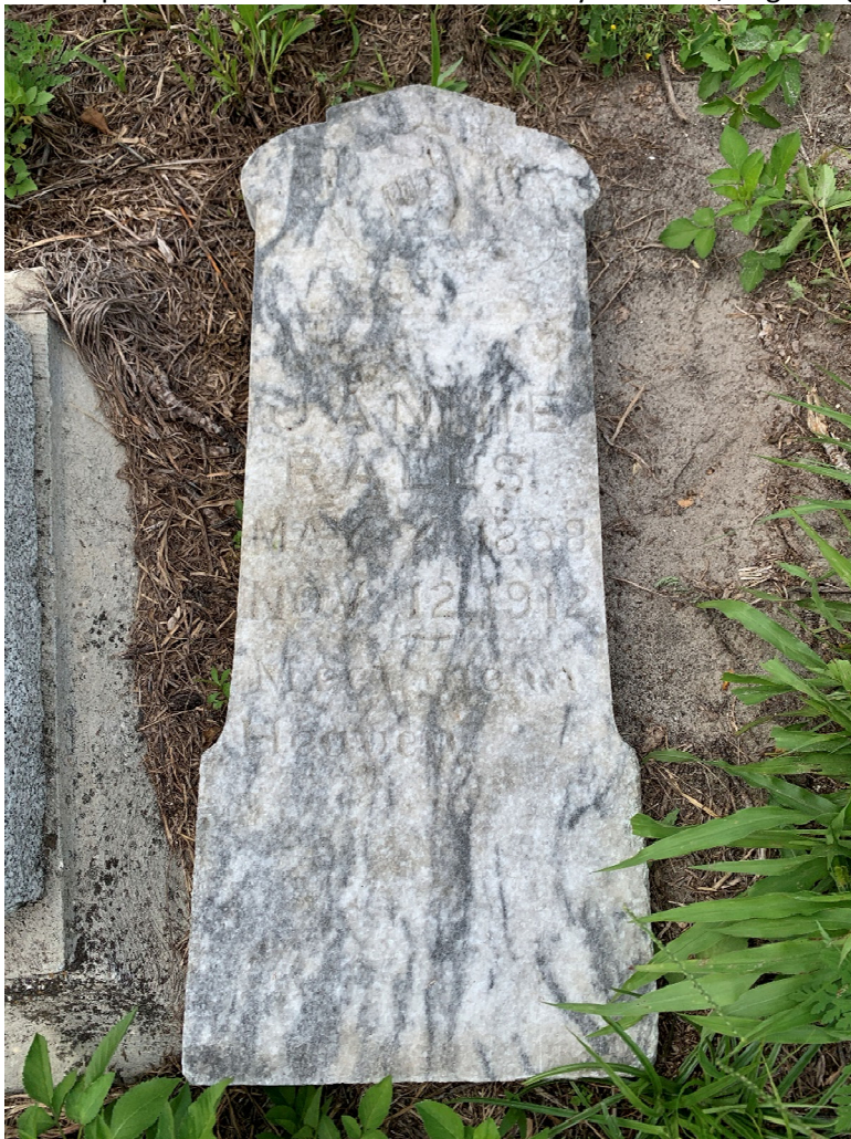
2 Headstone at Saint Peter Cemetery in Archer during cemetery cleanup.

In mid-June, FPAN Central lead a cemetery clean-up and discussion at Saint Peter Cemetery in Archer. Partnered with Saint Peter, Saint Paul Community Council of Archer, we touched on how to document and properly clean and maintain historic grave makers. This was also an opportunity to demonstrate to the cemetery caretakers, how to lift and reset gravemarkers. Plans were made to schedule more regular clean-ups at the Pinesville Historic Cemetery in Archer, beginning in the fall.