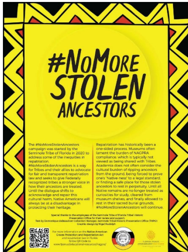
3- Poster made in partnership with the Seminole Tribe of Florida. Graphic design by Nigel Rudolph of the Central Region

Significant Central Region events include a continued and expanded work at the Bethlehem Methodist Episcopal Cemetery in Archer, assistance to the City of Groveland regarding a historic African American Cemetery, a season-closing Moon Over the Mounds tour at Crystal River Archaeological State Park, and scheduling History Bike Gainesville bicycle tours for the summer and beyond. The Central Regional office facilitated the pick-up and return to Crystal River, of a dugout canoe that had been re-conserved at the Bureau of Archaeological Research Conservation Lab in Tallahassee.