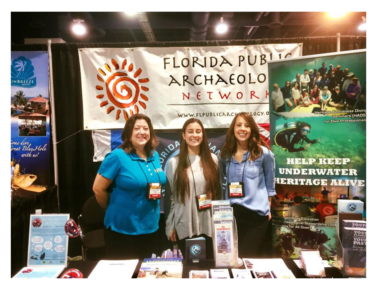
FPAN staff at the annual DEMA Tradeshow.