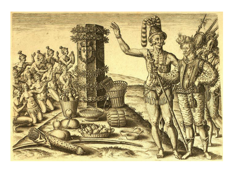
De Bry engraving of the Ribault Monument

Could we have learned the origins of the Timucua name from an archaeological dig? No way. That's the benefit of historical documents. If we can sift through the writings that don't ring true (i.e. the 250-year-old great-grandfather), huge amounts of worthwhile information is there for the picking.