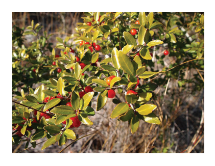
Yaupon Holly, photo by Wikipedia

The Timucua had no way of directly measuring caffeine content or absorption. But even without scientific equipment, the Timucua's grasp of plant technology allowed them to find and utilize the only plant in North America that produces caffeine.