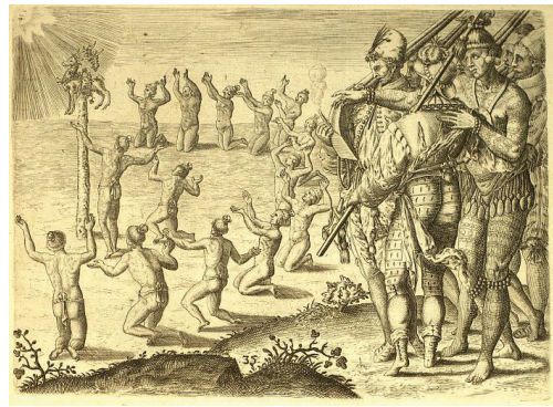
De Bry engraving of Timucua planting ritual

The de Bry engraving to the right shows a planting ceremony that took place each spring. The Timucua processed a deer hide so that it still held the shape of the living animal, then stuffed it full of fruits and grains. While chanting and celebrating, they raised the stuffed deer hide on a pole - as an offering to the Sun. This ceremony was an attempt to ensure a good harvest. This historical data suggests that the big questions in Timucua life were answered by religion, not by science.