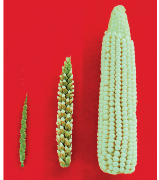
The photo above shows teosinte to the left, corn to the right, and a hybrid in the middle.

When the genetics of corn and teosinte were studied, scientists learned that these two plants differ in only five genes. A very few genetic changes made a very big difference in the corn. It turns out that the original teosinte had LOTS of genetic variation, meaning that some plants naturally produced plumper seeds, while others produced fewer stalks. The native peoples living in Mesoamerica preferred the plumper seeds over the tiny, hard, nut-like ones. As with sunflower, native peoples selected the larger teosinte seeds. A few thousand years of this artificial selection moved the crop towards a larger k