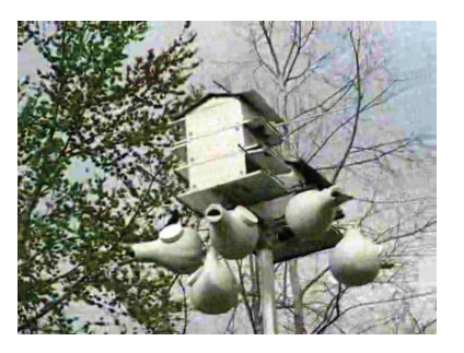
Martin house with gourds

What about the other crops? Bottle gourds were planted, probably along one edge of the field. Tobacco was planted as well. Sunflowers were often grown along the northern rim of the field so they didn't shade the other growing plants. Those big, tasty sunflower seeds would have attracted seed-eating birds from far and wide. So, how did the Timucua prevent the seed-predators from