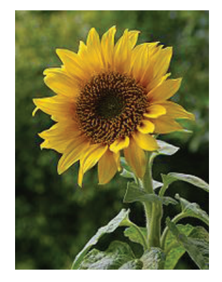
Sunflowers: when did they join the show? Wild sunflowers, with little 10 cm (4") flowers, are native to the east coast of North America, just like squash and chenopodium. They were domesticated about 2864 BCE in the Tennessee area. Archaeologists believe them to be domesticated because they discovered an increase in the width of the achene. The width of the what? An achene (ay-keen) is the thin hull that surrounds the actual seed in a sunflower. Native peoples were selecting for seeds with more nut inside, and replanting the biggest ones. In time, this artificial selection translated to wider achenes in the sunflower populations.