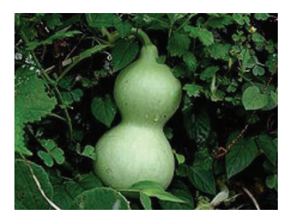
Bottle gourd

The Timucua did not clear cut their cropland. Instead, they left some fruit and nut trees standing. These trees provided shade for resting planters as well as roosting space for birds. In fact, the Timucua hung gourd birdhouses in the trees to encourage Purple Martins to move in. Why? Martins are insectivores (bug-eaters). Without modern pesticides, the Timucua depended on biological pest management. The birds ate crop-munching bugs (protecting the Timucua crops) and the Timucua provided the birds with homes and a steady source of food. Another symbiotic relationship. Technologies: Agricultural Science, Tool-Making