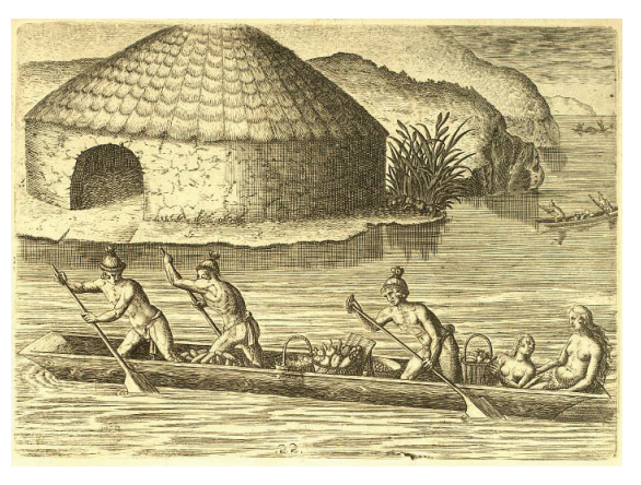
De Bry engraving of Timucua taking food to the storehouses

This de Bry engraving shows the Timucua transporting produce to a storehouse. In addition to storage huts within the community, larger storehouses like this one were also used. Why? The chief levied a tax on all of the plant foods produced. These foods were stored away to redistribute when food ran low. They were also used as status gifts to other chiefs and European explorers. (Archaeological Note: The hut in this engraving should not have mud walls. Palm thatching should cover the entire structure.) Technologies: Agricultural Science, Structures