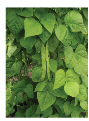
Bean vine

Corn had three major strikes against it. 1) It had less nutritional value. 2) It was harder to grow. 3) It was harder to process and cook. But boy, it tasted great.