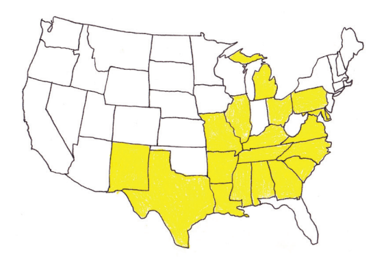
States Affected by Roundup-Resistant Palmer's Amaranth in mid 2011

The Timucua might have suggested harvesting the edible leaves, flowers, and seeds instead of treating amaranth like a weed. Sounds reasonable, right? Here's the problem. Amaranth is excellent at absorbing nitrogen from the soil. Because we apply so much nitrogen fertilizer to our crop soils, Amaranth absorbs a tremendous amount of nitrogen. In fact, it absorbs so much that it becomes toxic to animals and people. Our use of genetically modified seed, coupled with heavy herbicide use, has created a weed that is almost impossible to control. Our excessive use of fertilizers has made this weed useless as a food source.