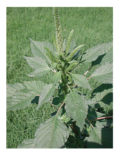
Palmer's Amaranth

Why create food that has no food in it? Five hundred years ago, agriculture was about producing food crops, shooing rabbits out of the fields, and keeping the weeds under control. The Timucua understood weeds. They spent a great deal of time hoeing the hills to keep competing weeds away from their crops. Even so, they would have been amazed at the weed problems modern man has created.