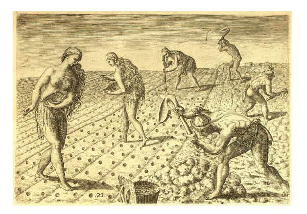
A Theodore de Bry engraving of the Timucua planting their fields. Despite the MANY errors, these engravings can be a useful learning resource.

Timucua men did the back-breaking work of hoeing up the soil. Loosening the top layer of dirt disrupted weed growth and allowed oxygen into the soil. The tiny germinating crop roots also moved more easily through the loosened dirt. <u>Technologies:</u> Division of Labor and Agricultural Science